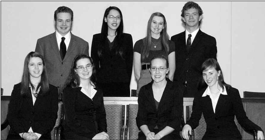
Holy Family High School Team A.