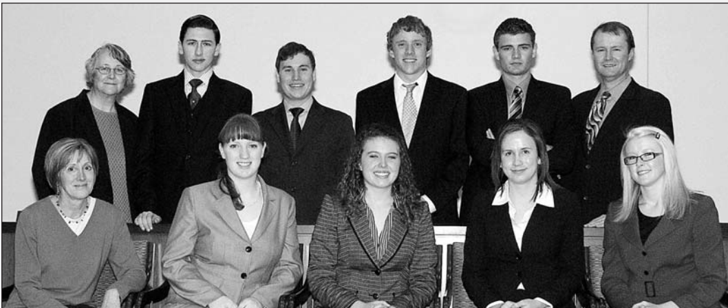
Regis Jesuit High School Team A.