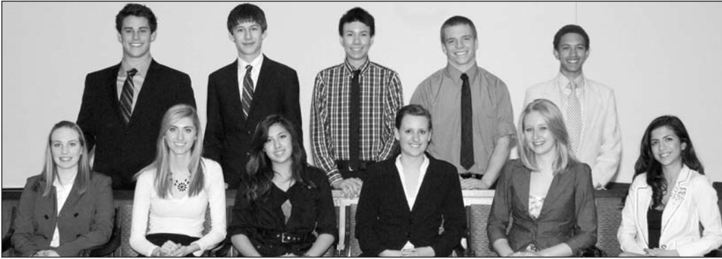
Rock Canyon High School Team A.