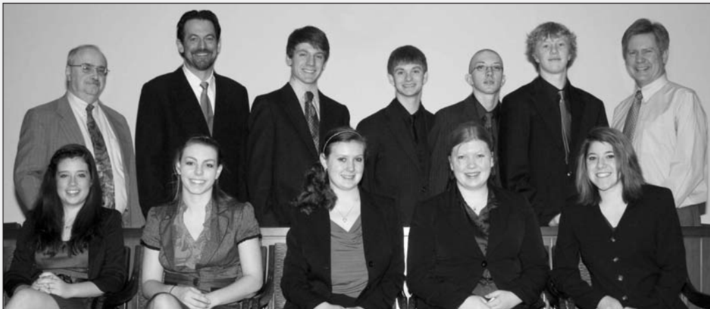
Glenwood Springs High School Team B.