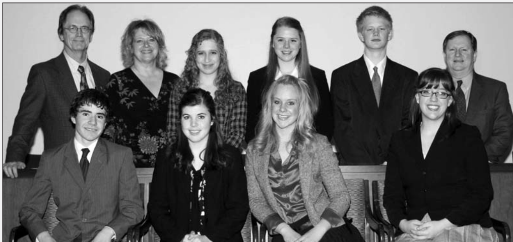
Wm. Jackson Palmer High School Team A.