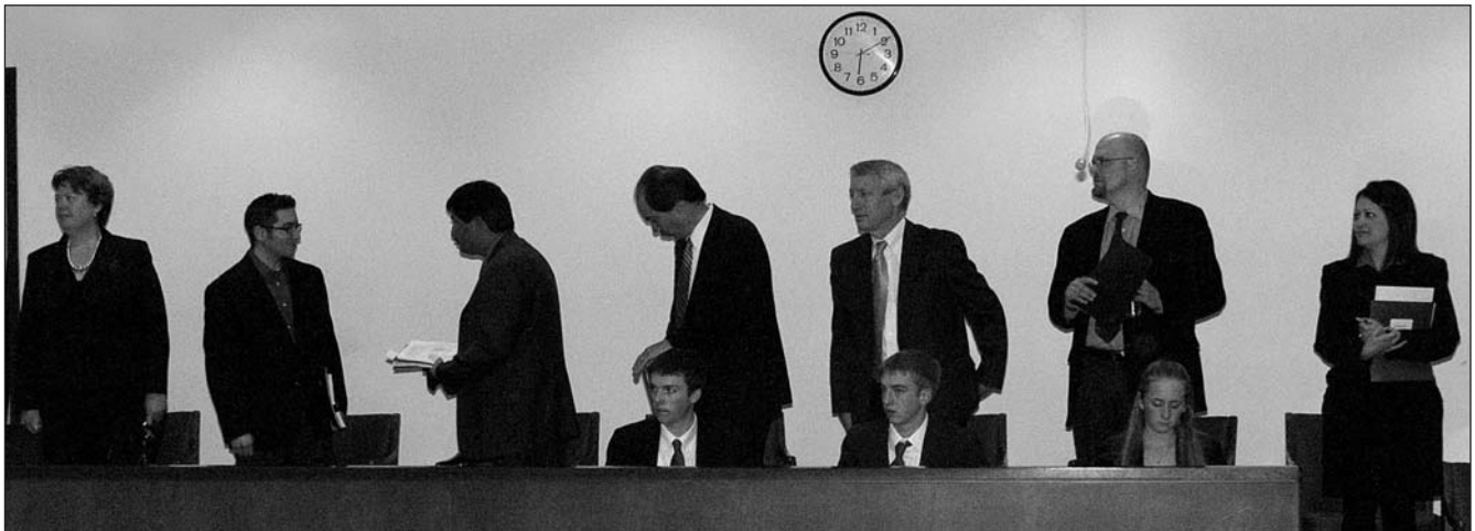
Scoring panelists for the championship round.