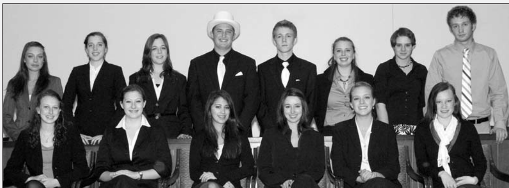
Boulder High School.