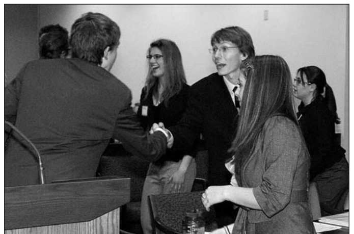
Championship round team members meet in the courtroom.