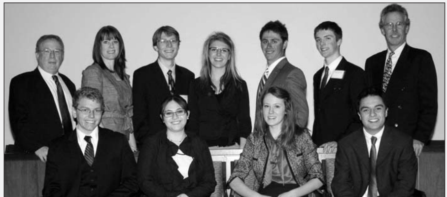
Lakewood High School Team A.