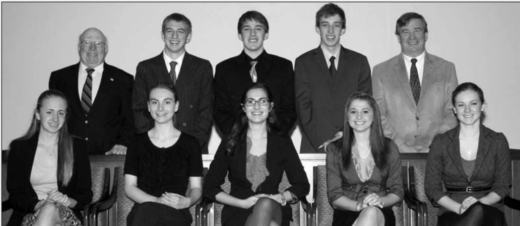
Glenwood Springs High School Team A.