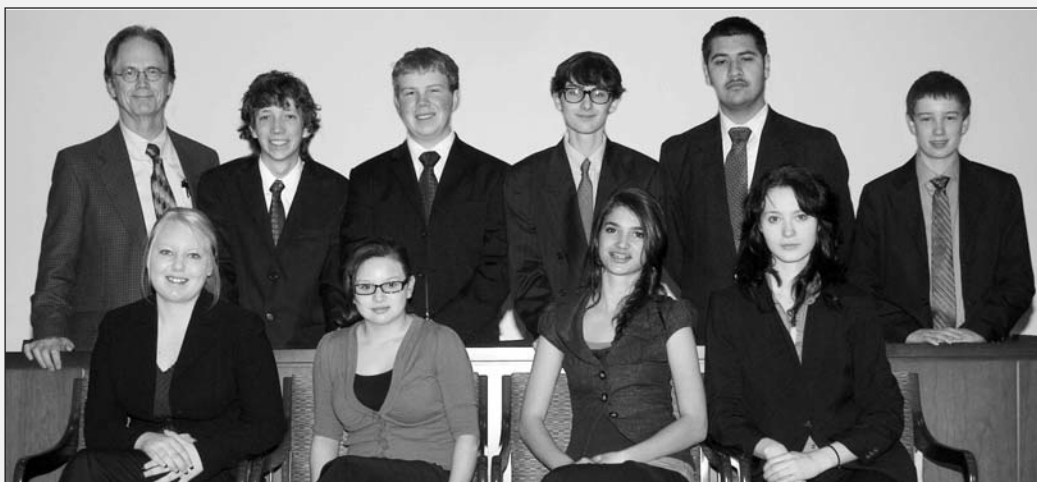
Wm. Jackson Palmer High School Team B.