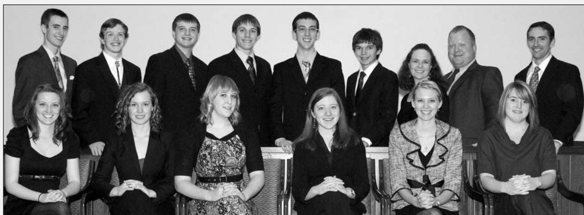
Ridgeview Classical School Team A.