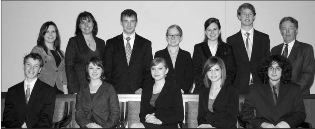
Air Academy High School Team A.