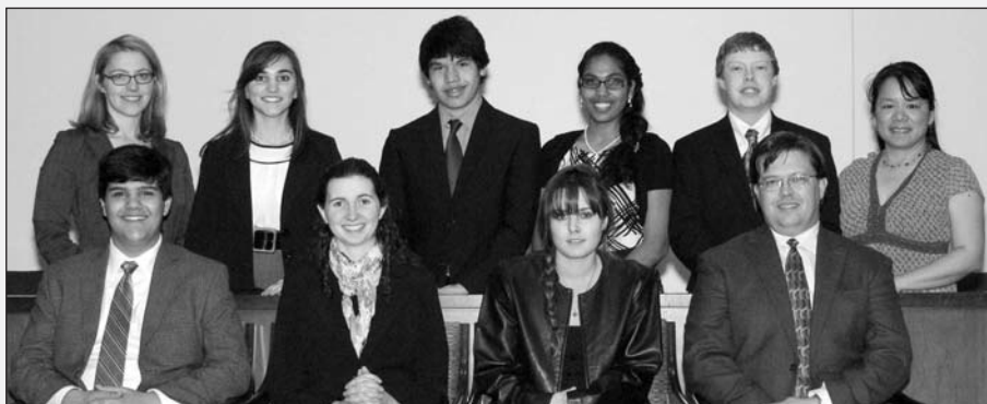
Peak to Peak Charter School Team B.