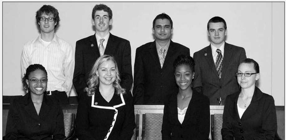
Aurora Central Team A.