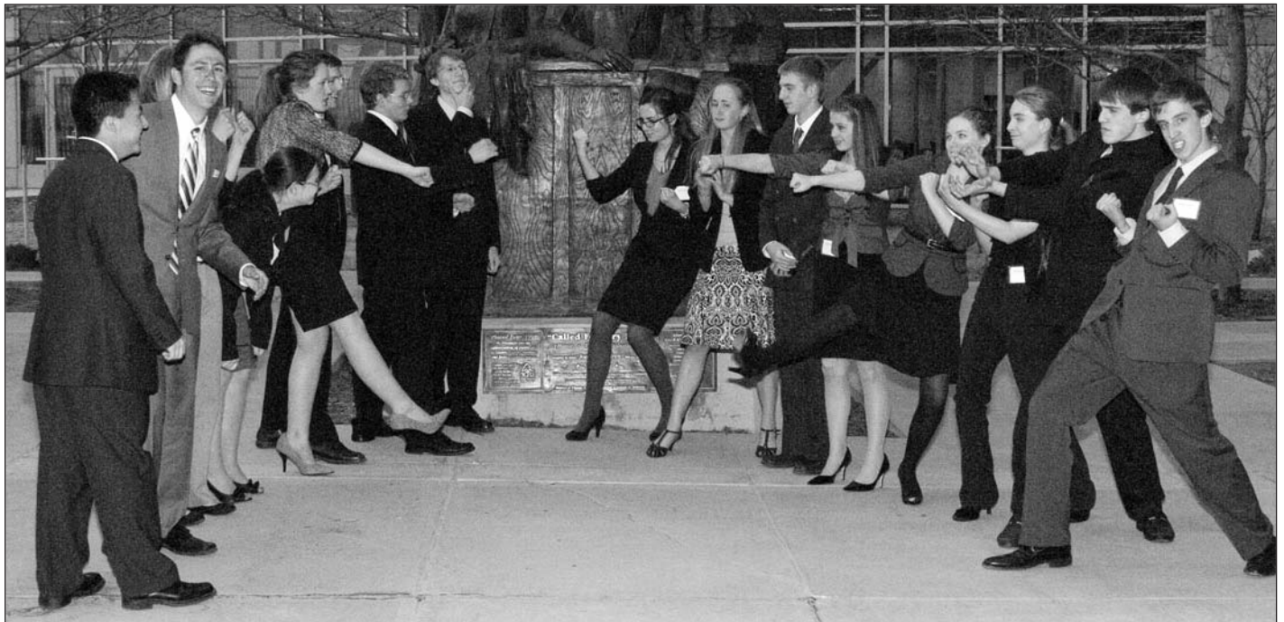
Finalist teams: Lakewood High School (left) and Glenwood High School.