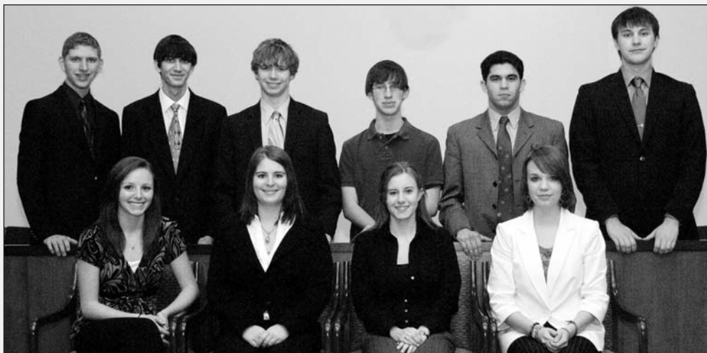
Fossil Ridge High School Team A.