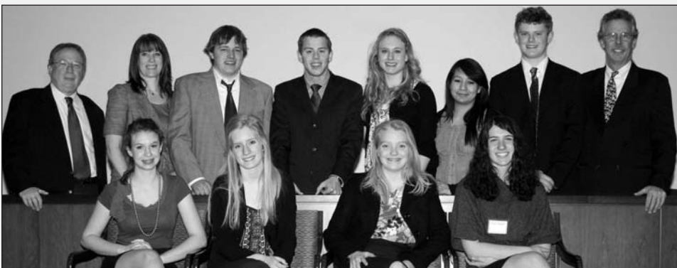
Lakewood High School Team B.