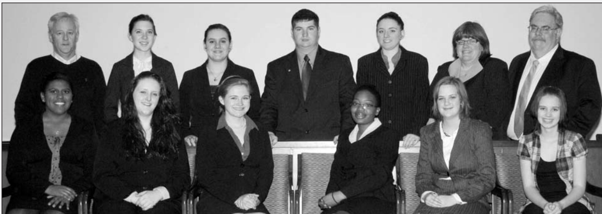
Thomas B. Doherty High School Team A.