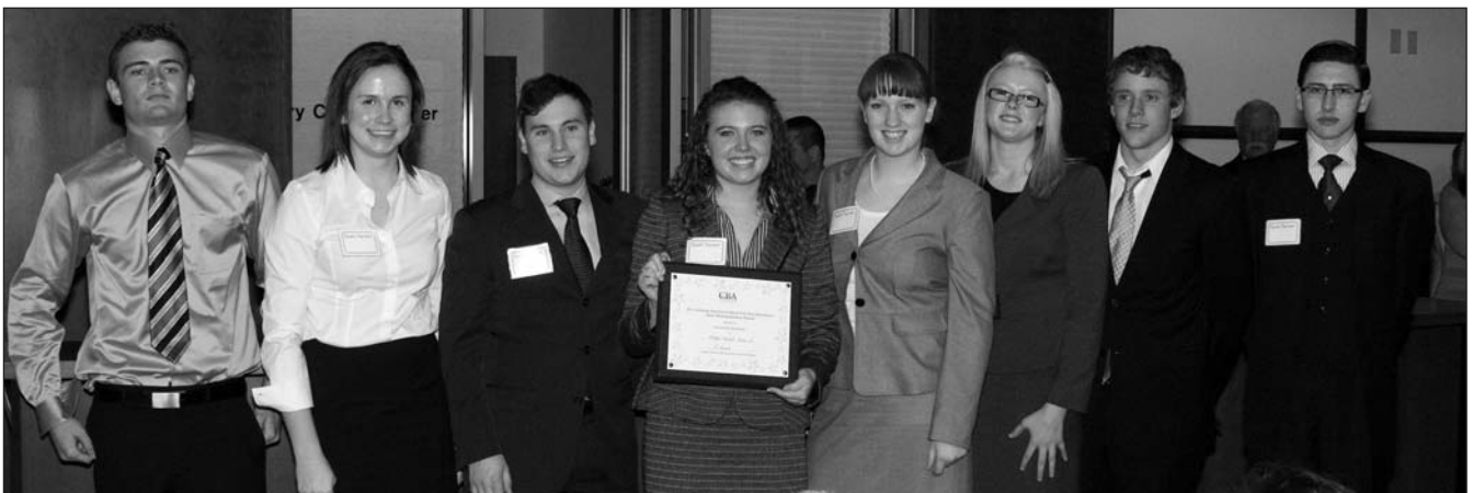
Team Professionalism—Regis Jesuit.