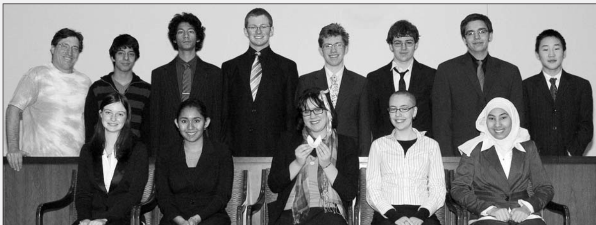
Poudre High School Team A.