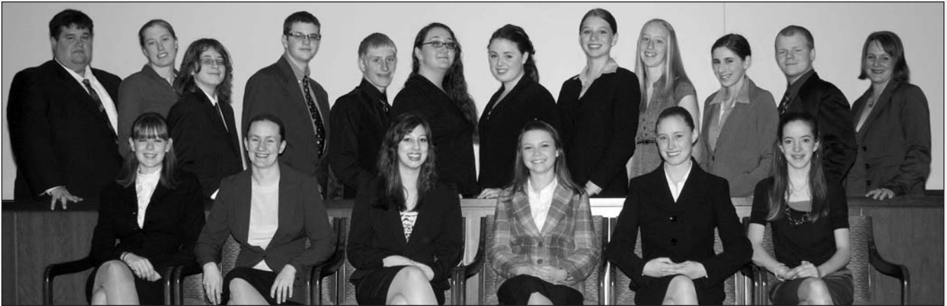
Coronado High School Team A.