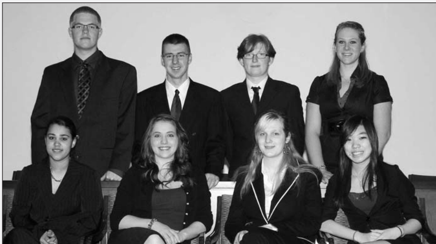
Sand Creek High School Team A.